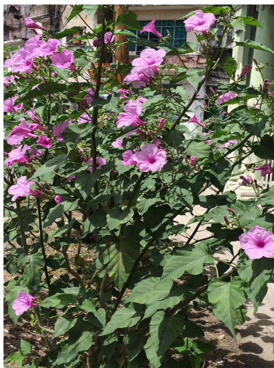
Figure (1)ipomea carea shrup [3]

The treatment of fungal diseases chemically is accompanied by many problems, including the emergence of resistance by fungi to antifungals, as well as some antibiotics that are characterized by their high toxicity towards humans, causing collateral damage to the kidneys, liver, and bone marrow. Therefore, voices appeared calling for alternatives to these antibiotics, and plant extracts are among the successful alternatives that have been used since ancient times. It is still widely used because it is cheap and has few side effects compared to chemicals. Plants have survived in the treatment of fungal, bacterial, parasites, viruses and many other diseases [9, 10].