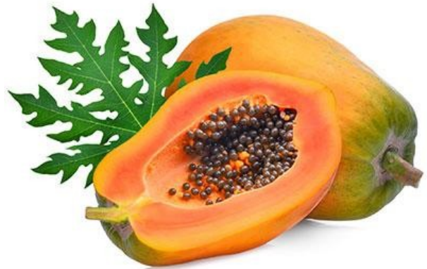
Fig 3: Carica Papaya fruit

alone, but often in clusters. The flesh at development is yellow-orange to salmon. Plants start to yield fruits in 6-12 months [10].