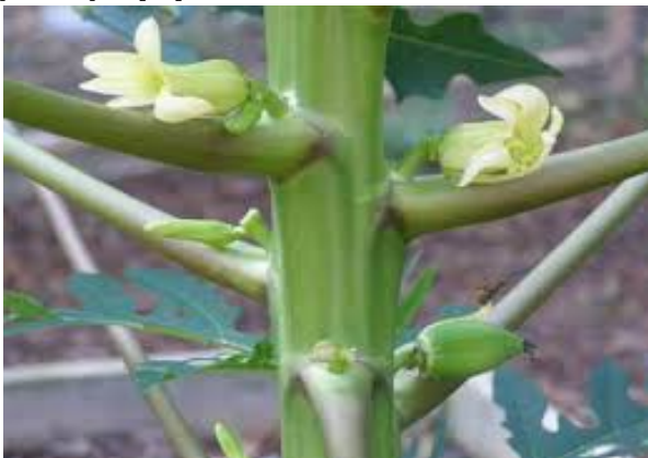
Fig.2 Carica Papaya flowers

Papaya plants are hermaphroditic or dioecious, producing only female, male or bisexual flowers (Fig. 2). Bisexual and female flowers are ivory white, waxy, and borne on short peduncles in leaf axils, along the main stem. Flowers are solitary or small cymes of three individuals. Ovary position is superior. Since, bisexual plants produce the most desirable fruit and are self-pollinating, they are preferred over male or female plants. Female flowers of papaya were pearshaped [10].