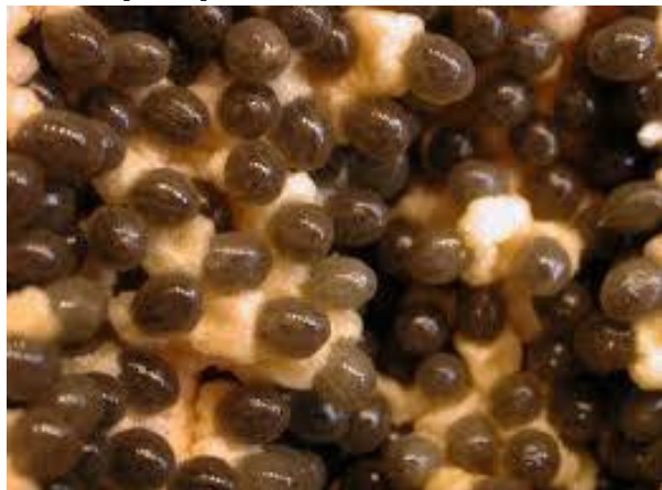
Fig.5. Papaya Seeds

Generally, the papaya plant grew up from the seeds. The colour of the seeds is black and having fleshy endosperm, and a straight embryo [11]. The seeds are present inside the cavity of the fruit and coated with a mucilaginous substance [17, 18].