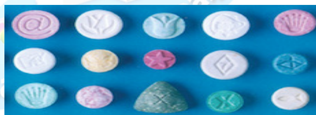
Fig.2:- Child Ecstasy Tablets

In most countries Possession of MDMA is illegal. Some limited exceptions are exist for the scientific and medical research. MDMA may have health beneficial effects in certain mental disorders, but also has potential adverse effects that include neurotoxicity and cognitive impairment. 45